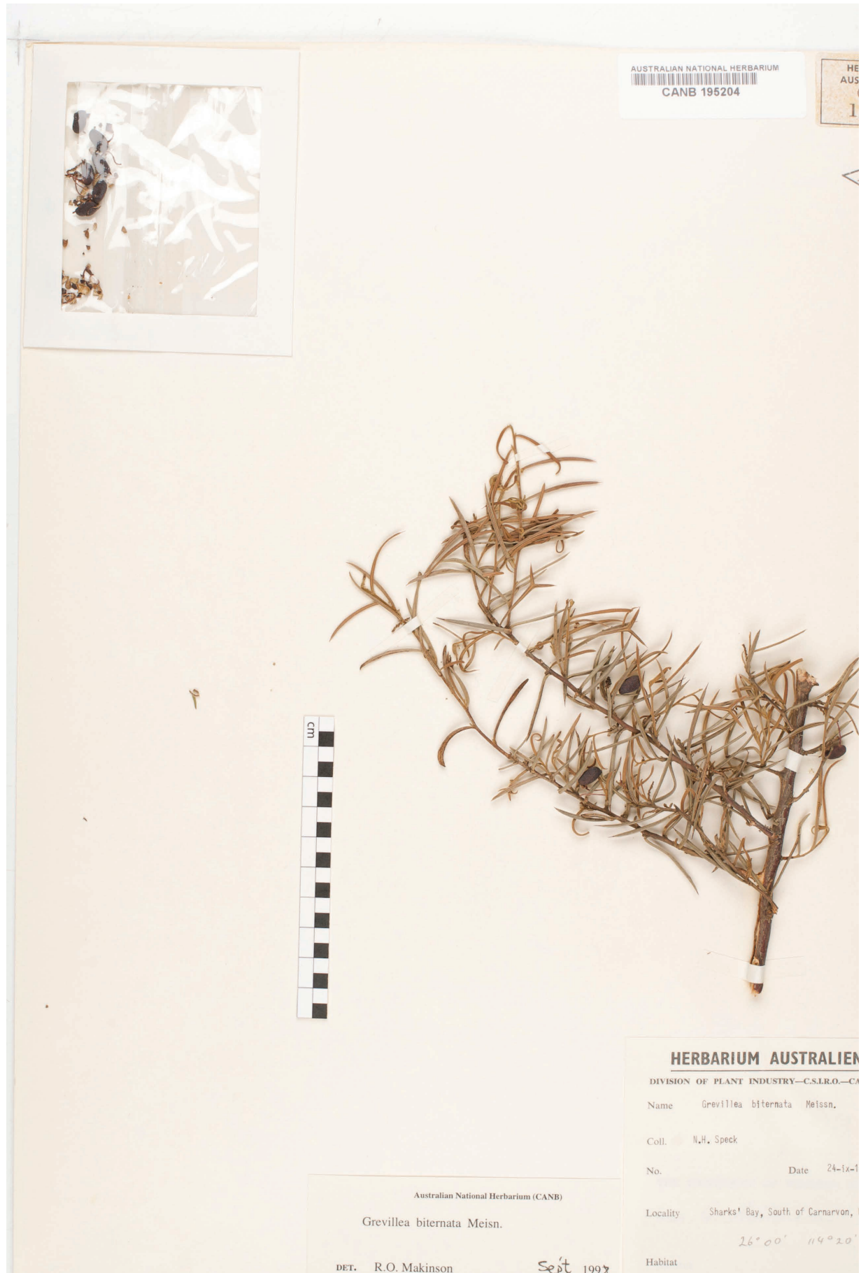
Fig. 2. Isotype of Grevillea speckiana (CANB 195204).