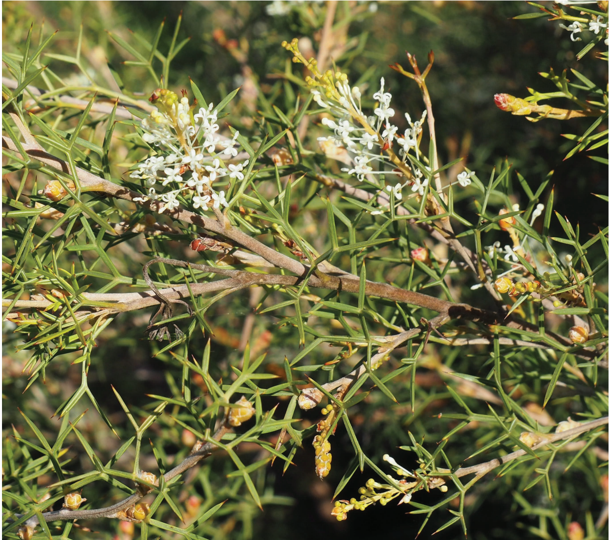
Fig 2. Grevillea pieroniae showing enlarged inflorescence buds.

Distribution: Western Australia where known only from the central Stirling Range National Park, south-west Western Australia in three areas. It occurs in the Gnowangerup LGA, in the Fitzgerald Subregion of the Esperance Plains IBRA Region.