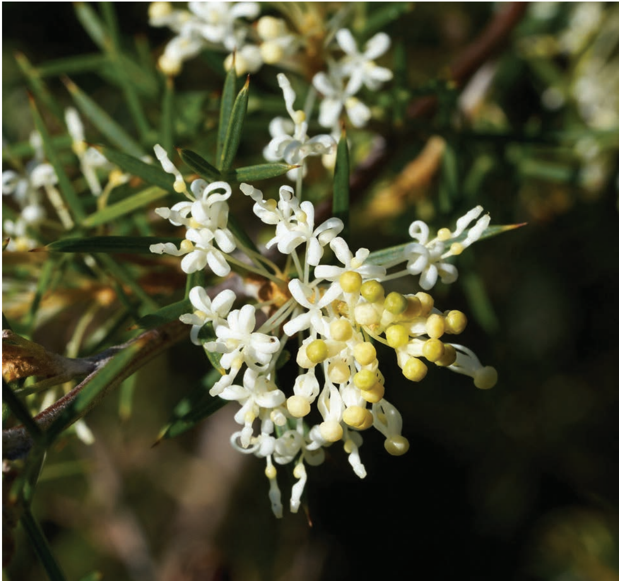
Fig. 1. Grevillea pieroniae .

limb; abaxial surface glabrous, smooth with midrib prominent; adaxial surface glabrous or a few scaly simple trichomes 0.1–0.2 mm long at base, papillose and usually farinaceous, the midrib obscure; tepal-limbs 1–1.2 mm long, 1 mm wide, with prominent midrib. Fruits follicular, monospermous, 7–11 mm long, 4.5–6 mm wide, oblong–ellipsoidal, transverse to very oblique on erect gynophore, the pedicel strongly curved, attachment subposterior 2–3 mm from base on dorsal side; fructual style lateral to the dorsal side, erect or decurved, sometimes slightly oblique; fructual pollen–presenter cylindrical; pericarp 0.4–0.7 mm thick along the suture, slightly thicker at the ends; exocarp almost smooth to moderately rugose with discontinuous rounded ridges and irregularly colliculate; mesocarp crustaceous; endocarp smooth, membranaceous. Seeds not seen.