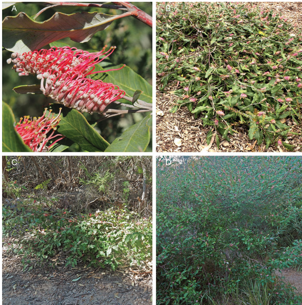
Fig. 2. Grevillea macleayana . A. Flowers and foliage from a medium spreading shrub near Point Perpendicular light-house. B. A prostrate plant from near Racecourse Creek, Ulladulla, in cultivation. C. Decumbent shrub near Currarong on track to Abrahams Bosom. D. Sub-arborescent shrubs near Blenheim Beach.

divergent from style, unguiform; pollen-presenter 1.2 mm long, 1.2 mm wide, oblique to almost transverse, round to ovate-elliptic, the surface flat to broadly convex; perianth 8–10 mm long, 1.5–2.5 mm maximum width, oblong-sigmoid, narrowed to 1 mm wide at the curve, tomentose outside, glabrous inside, the inner surface scarcely visible, after anthesis, falling as a coherent unit; tepals attached to the toral rim; limb 2.5 mm long, 2 mm wide, white, ovoid, declined, densely sericeous-tomentose to tomentose-villous, tightly enclosing the style-end; anthers 1.2 mm long; pollen translucent to white or pink, sometimes abundant. Fruit 12–19 mm long, 8 mm wide, on inflexed pedicel, laterally compressed, oblong/ovoid, the apex attenuate; style persistent; pericarp c. 0.5 mm thick; exocarp tomentose, purple-striped or in irregular patches, ridged on dorsal side; mesocarp crustaceous; endocarp smooth. Seed 15 mm long, 5 mm wide, elliptic, rugose. (Figs 1B, 2)