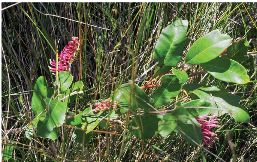
Fig. 4. Grevillea milleriana . A. Plant in natural habitat.