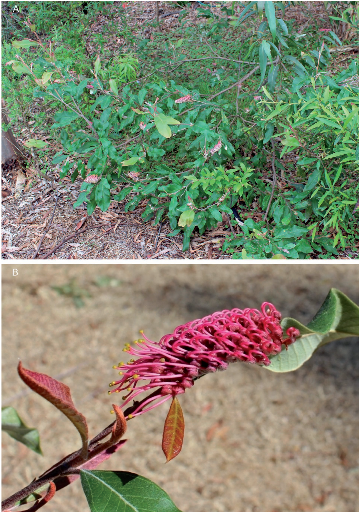
Fig. 3. Grevillea gilmourii . A. Young plant in cultivation, Moruya, NSW. B. Conflorescence and new growth in cultivation.