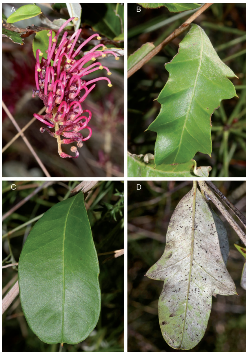
Fig. 5. Grevillea milleriana . A. Confflorescence. B–D. Leaf variation.