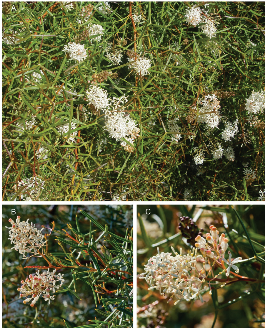
Fig. 1. Grevillea merceri . A. Dense flowering branchlets and leaves. B. Flowering branchlet. C. Close-up of conflorescence.