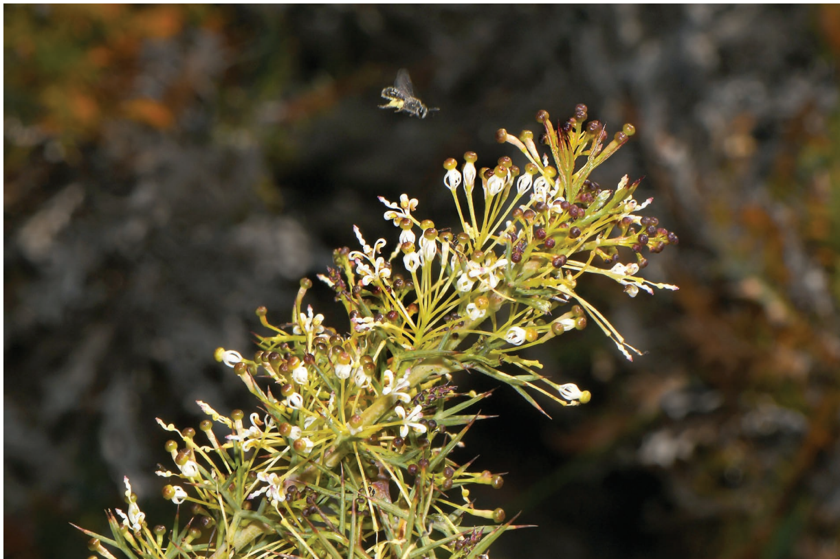
Fig. 1. Grevillea hortiorum with tiny native bee pollinator hovering.