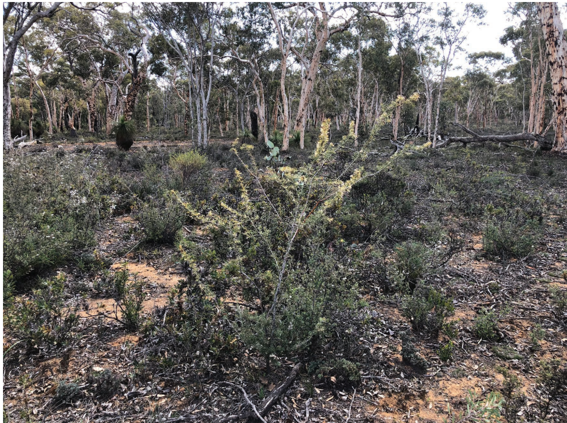
Fig 3. Grevillea hortiorum in natural habitat.