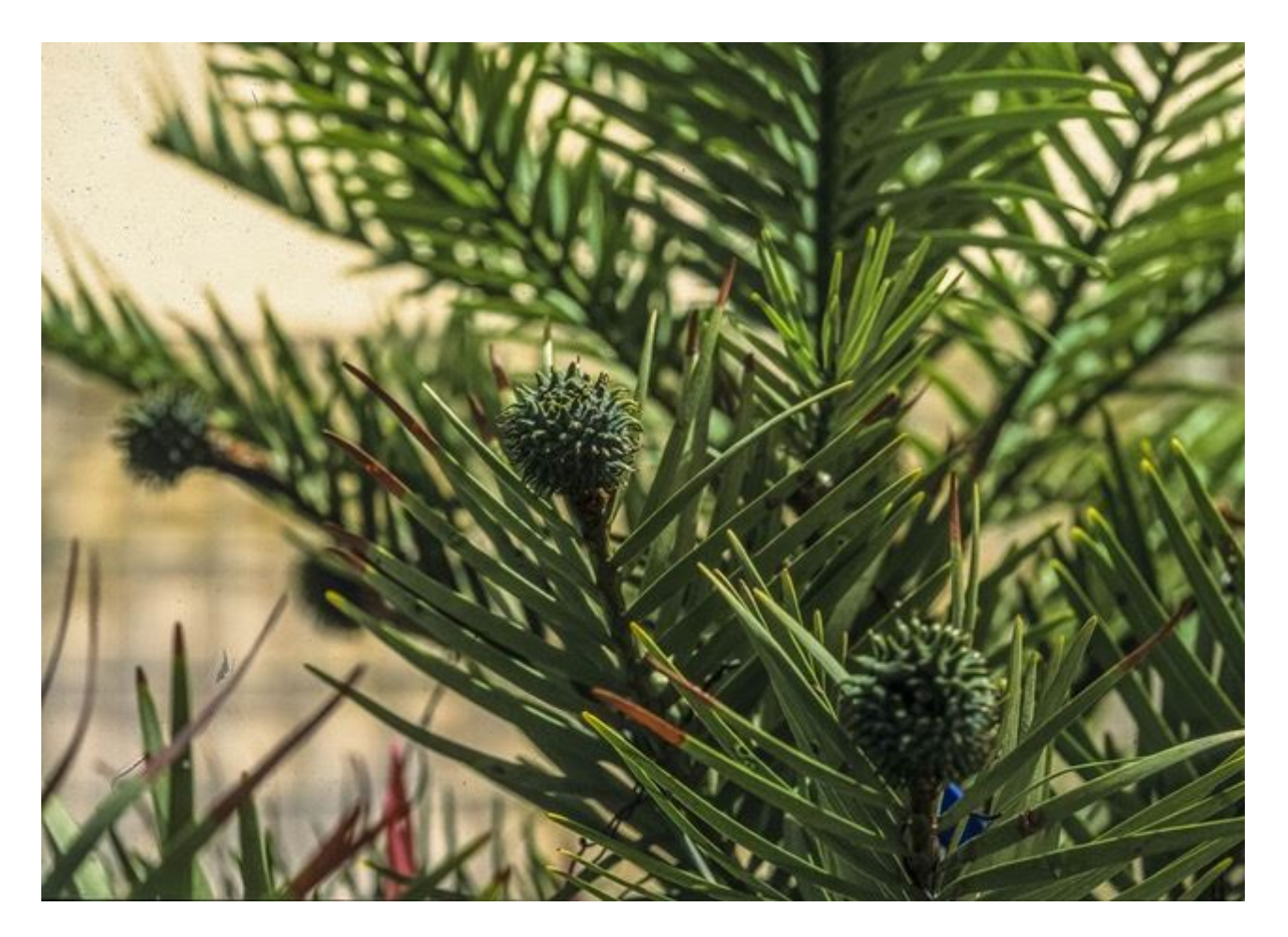
Wollemia nobilis (female) (A Fairley) Ensuring the survival of the Wollemi Pine

Discovering the Wollemi pine has been described as the botanical find of the 20th century. The Wollemi pine was once widespread across Gondwana before Australia broke off from Antarctica. It's both a living fossil and a global treasure and, while it is truly a rare and threatened species that needs to be conserved for the future, this is a challenging project.