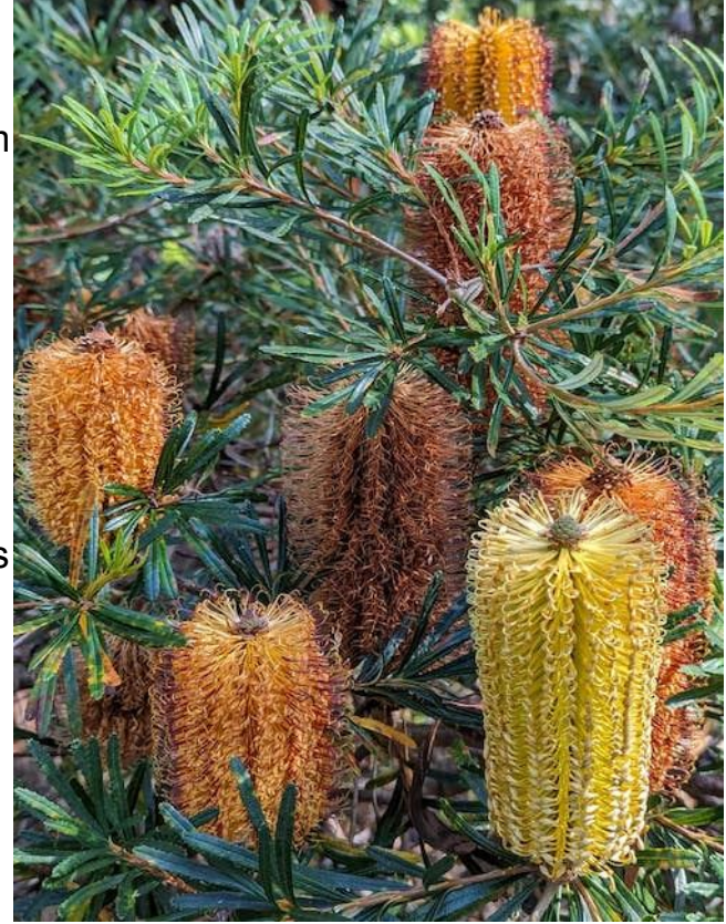
Banksia Bush Candles (T Lea)