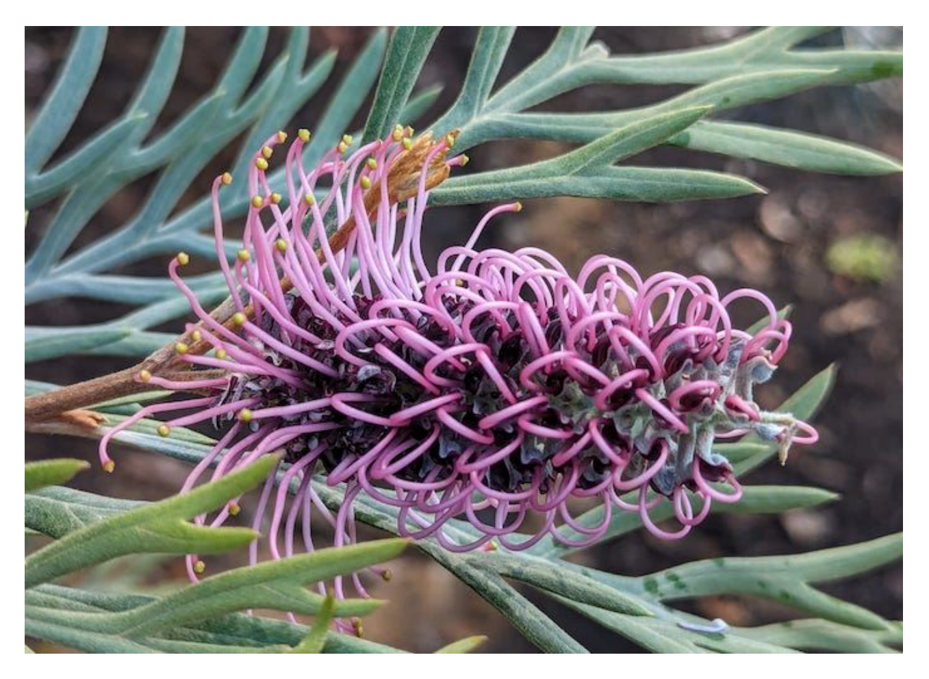
Grevillea 'Dorothy Gordon'