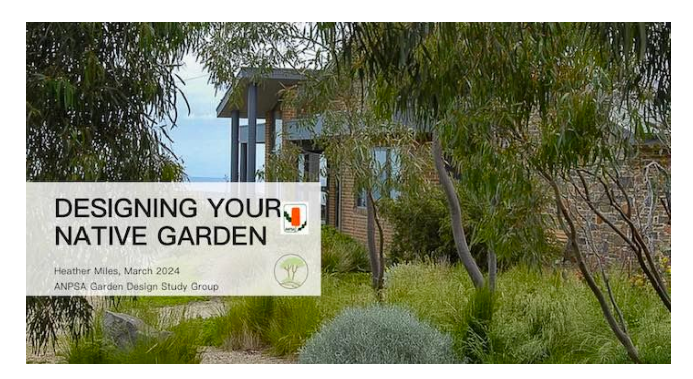
Designing your native garden (H Miles)