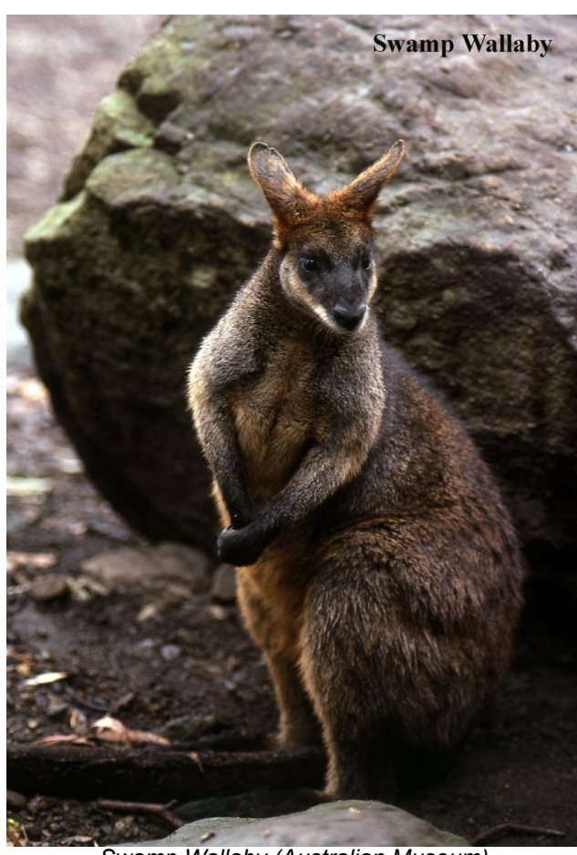
Swamp Wallaby (Australian Museum)