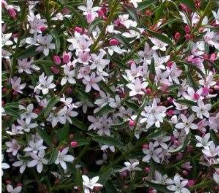
The winter flowering shrub Philotheca 'Winter Rouge'

The monthly enewsletter of the Australian Plants Society NSW