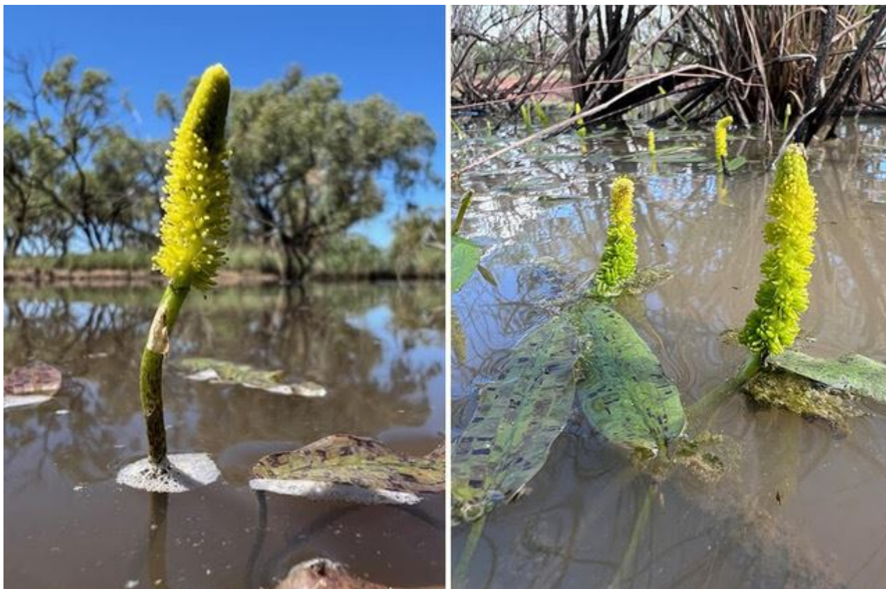
A. queenslandicus