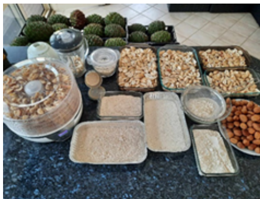
Bunya cones and processing (L Pine)