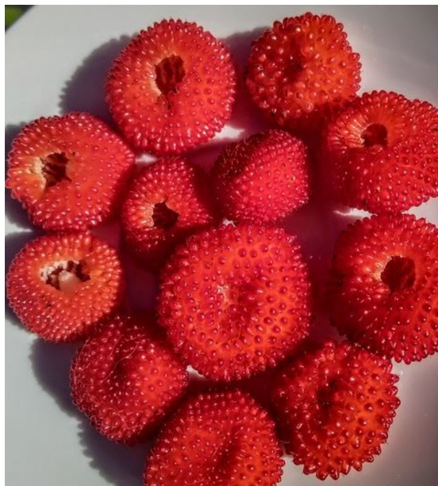
Native Raspberry (T Lea)

The Illawarra region has several useful food plants locally occurring and many others from outside the region also grow well here. They have different uses from eating straight from the plant to steeping in water (hot or cold), drying and grinding, or adding to more conventional recipes such as marinades and cakes etc.'