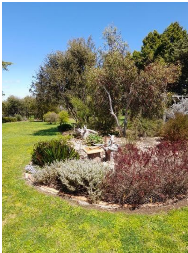
Armidale Arboretum