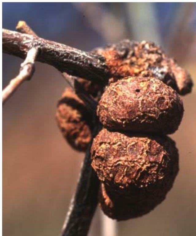
Swellings on Acacia aneura