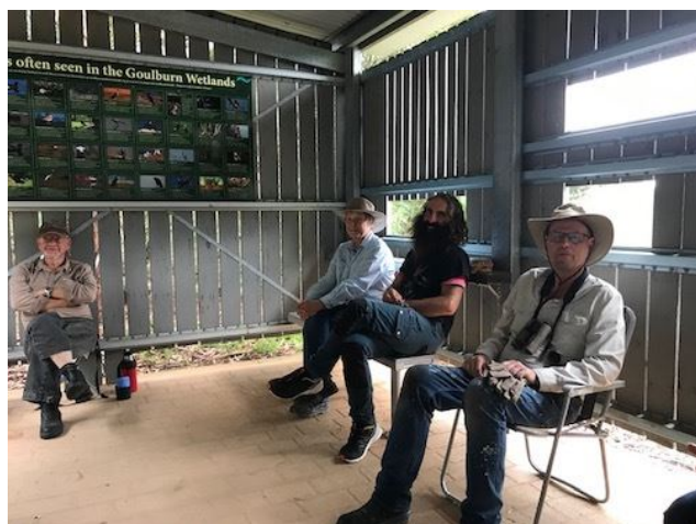
Costa and team at the wetlands

In March, FROGS ( Friends & Residents of Goulburn Swamplands ) Landcare volunteers played host to Costa Georgiadis as he visited the Goulburn Wetlands. Many of you will know that Costa has long been interested in the Wetlands—he planted trees with local school children in 2016 and live-streamed an impromptu visit in 2022. This time he came to film the Wetlands and its gardens for a segment on Gardening Australia.