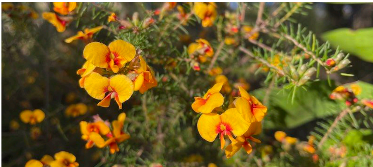
Dillwynia retorta 'Eggs and Bacon' (L Godden)